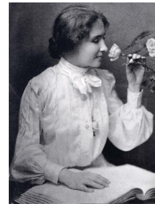
Helen Keller - Born in Tuscumbia, Alabama on June 27, 1880 Died June 1, 1968

This is the opportunity I offer you, Lions—to foster and sponsor the work of the American Foundation for the Blind. Will you not help me hasten the day when there shall be no preventable blindness, no little deaf blind child untaught, no blind man or woman unaided? I appeal to you, Lions—you who have your sight, your hearing, you who are strong and brave and kind—will you not constitute yourselves Knights of the Blind in my crusade against darkness?